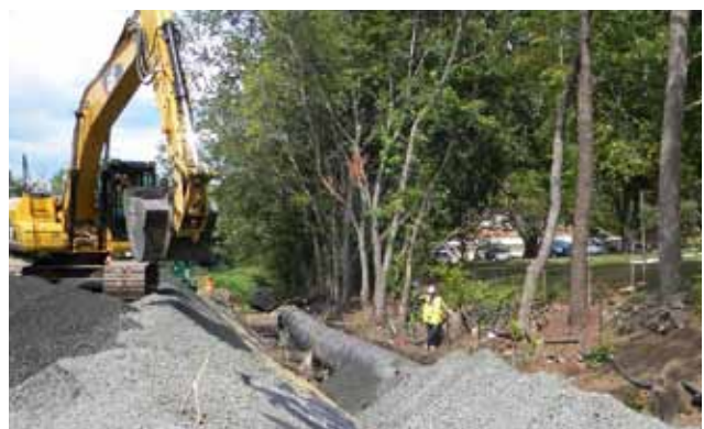
Installation of bypass piping to manage the flow of Coles Brook during soil remediation at the 111 Essex Street, Maywood property.