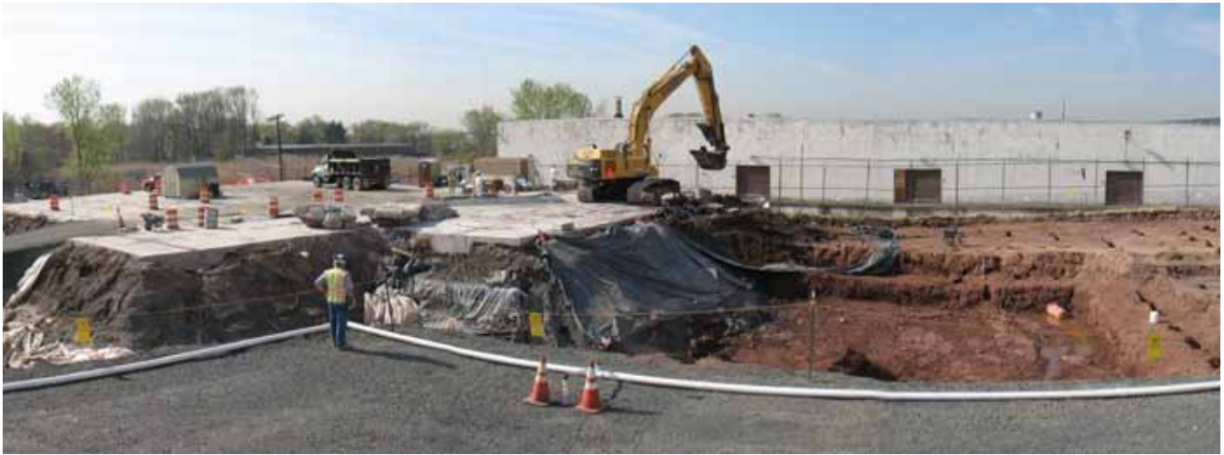
An April 2010 view of remediation at one of three waste disposal pits on the 100 West Hunter Avenue, Maywood vicinity property. Excavations in this area went as deep as 15 feet.