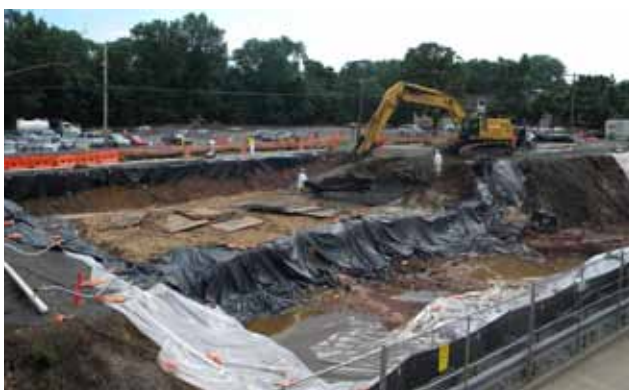
Remedial excavations well underway at one of two Recovery Act-funded burial pit cleanups at the FUSRAP Maywood Site.

To support the increased workload, the Maywood project hired additional workers. Recovery Act funding is directly responsible for the addition or retention of 31 full-time jobs at the Site. These positions include equipment operators, carpenters, laborers, truck drivers, construction and engineering management, safety technicians and administrative support personnel. Many of these positions were filled by local people from communities in the North Jersey area. The work has also trickled down to many area subcontractors. Subcontracted services such as fence installation, tree clearing and clean backfill have been obtained from local businesses.