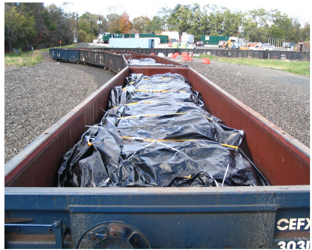
Over 220,000 cubic yards of contaminated soil have been shipped offsite for safe disposal. That's enough to fill about 3,100 rail cars like the one pictured here.