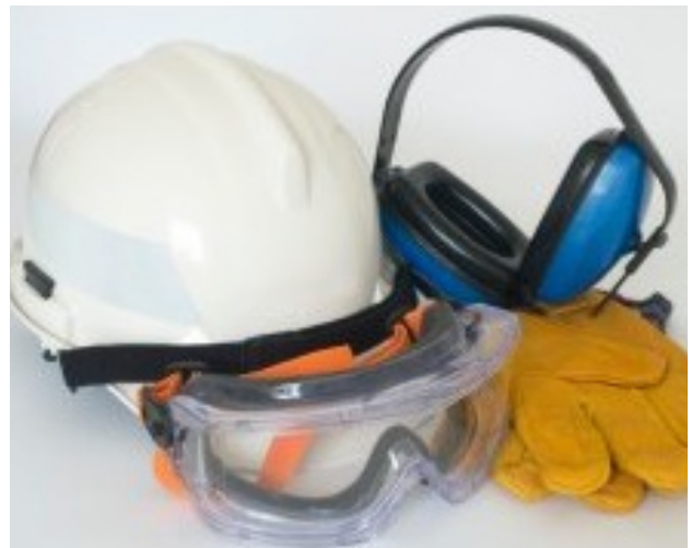
The project has logged over 2,100 days without a lost time accident (LTA). An LTA is an incident resulting in days away from work and/or days of restricted duty. The last LTA at the Maywood Site occurred in August 2003

Inside... Page 2 - More about Our Safety Record