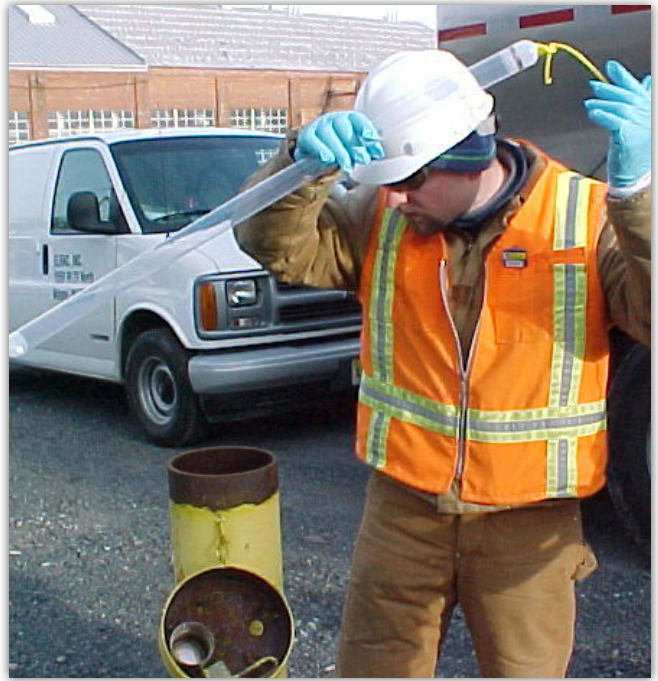
Groundwater sampling is a key element of our site-wide Environmental Monitoring Program.

The data are then compiled and evaluated in an annual report that is submitted to the New Jersey Department of Environmental Protection and the U.S. Environmental Protection Agency. All annual EMP reports are available at our Public Information Center. In addition, the most recent report is available online at www.fusrapmaywood.com (see page 4). Just click on What's New on the homepage.