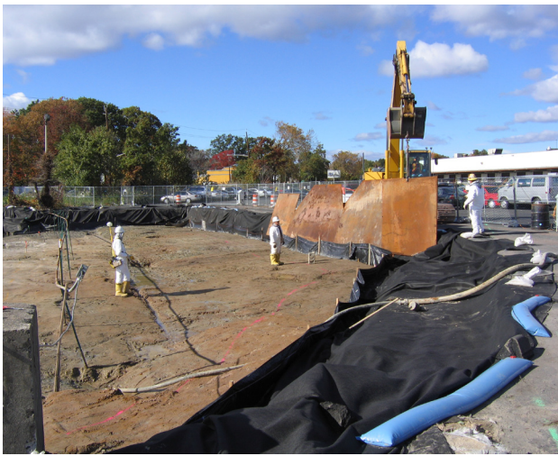
16 of 24 commercial properties have been cleaned up and restored and four more are well underway.