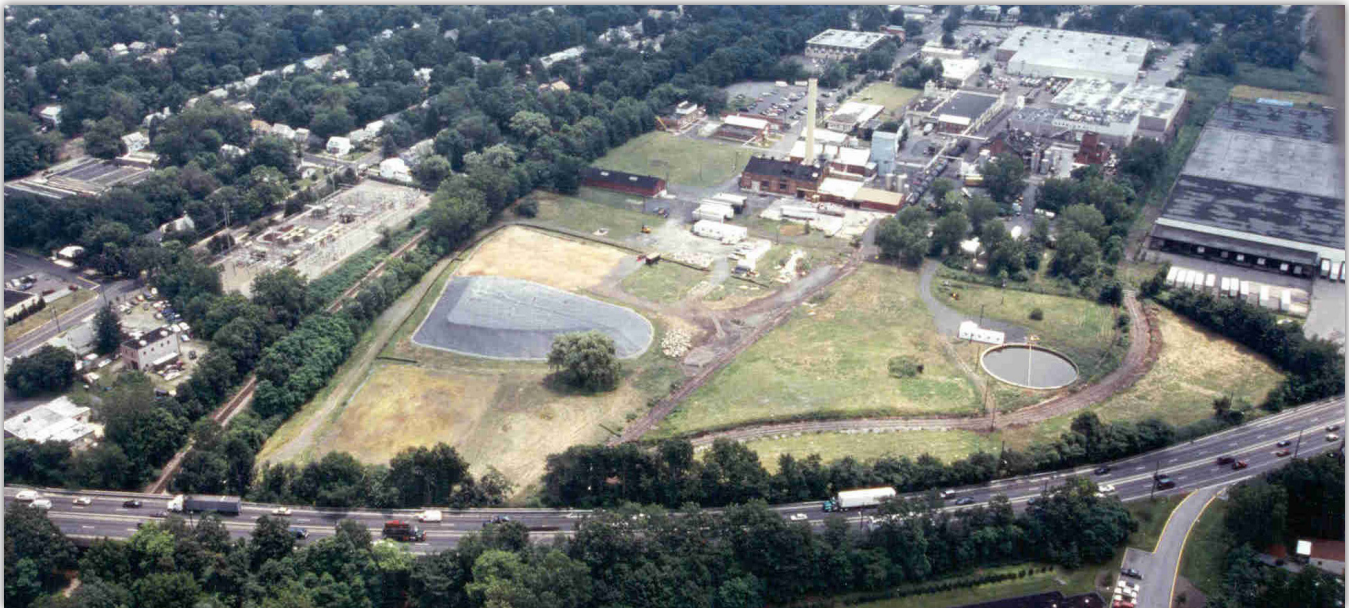
An aerial view of the Maywood Site and vicinity. A network of monitoring devices and sampling locations ring the area to track environmental conditions over time.